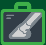
PORTABLE DIGITAL X-RAY